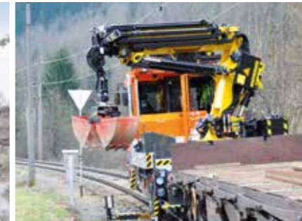
Clamshell buckets Turn a crane into a versatile machine

Snow blowers fitted on the crane boom enable surfaces and paths alongside the vehicle to be cleared.