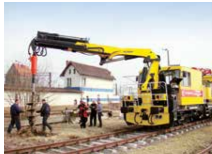
Augers To prepare mast foundation holes

Ideal for preparing foundations for masts of overhead cables and signaling systems. The augers are available in different diameters.