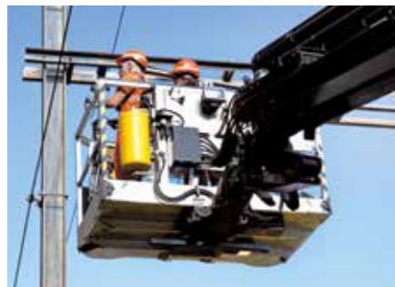
Workman baskets For working on overhead wiring

Cable winches facilitate the handling of bulky parts, for example installing masts below existing catenary systems.