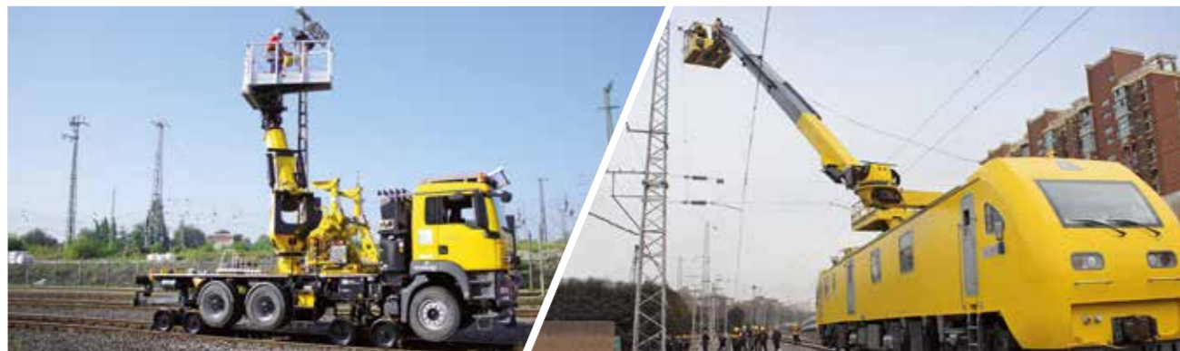
PA115 in Austria