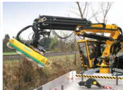
Branch saws To cut the structural clearance outline along the line

Workman baskets are an ideal tool, especially for working on catenary systems. Fixed or slewable workman baskets are used depending on the field of application.