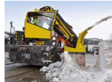
Snow blowers To clear areas of snow

The use of mulchers to remove vegetation is both efficient and environmentally friendly.