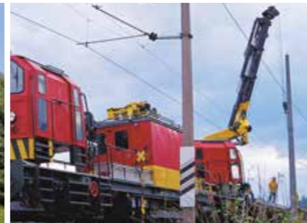
Cable winches To improve handling of parts

Various types of pile drivers (impact or vibration type) can be fitted to suitable crane models to ram mast foundations into position.