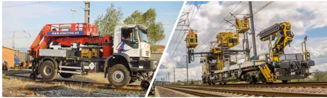
PA95 & PK16502 in Spain

Rapid and safe access to all positions in the overhead line and power supply system.