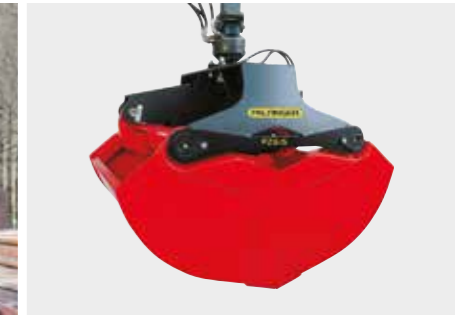
Bulk material grabs For track ballast, construction rubble and excavated earth

The universal clamshell bucket is ideal for day-to-day digging and loading applications.