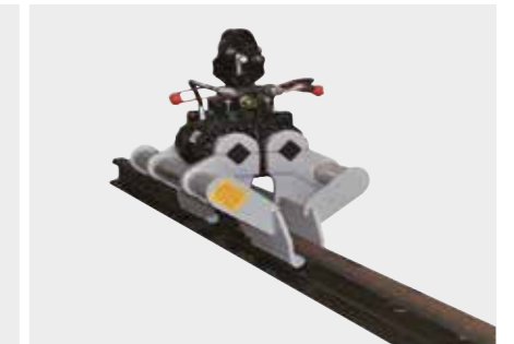
Rail grabs To handle rails and sleepers

PALFINGER offers a wide range of multi-arm grabs for handling waste and scrap. Available with 4, 5 or 6 grab arms and with full-length arms, half-length arms or arms with grab tips.