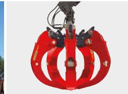
Polyp grabs Multifunctional device

The timber grab is used when handling railway sleepers and short railway elements.