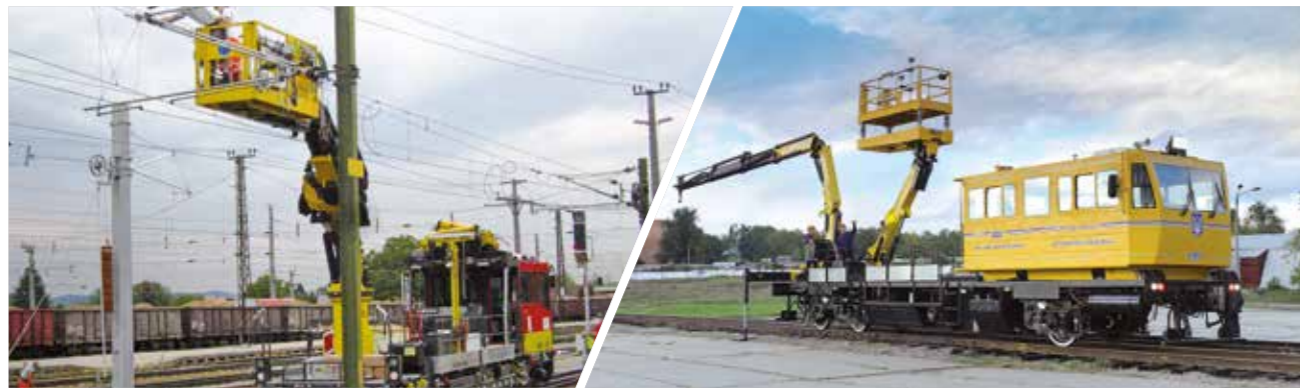
PA240 & PFD99 in Austria