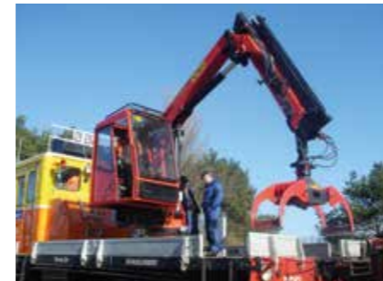
Timber grabs To position sleepers and railway elements

The robust bulk material grab is ideal for transporting bulk materials such as track ballast, rubble and excavated earth, and can also be used for light-duty digging.