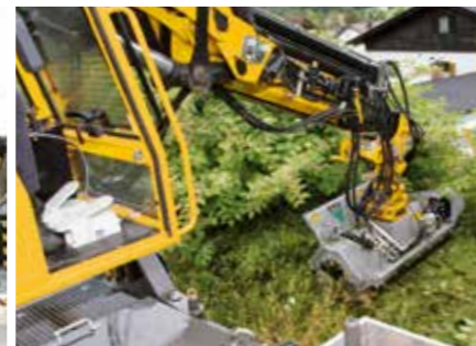
Mulchers To remove vegetation along the line

Branch saws or even branch shears allow the clearance outline to be cut. The cabin offers optimum protection for the operator.