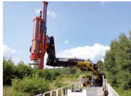
Pile drivers To drive mast foundations into position

Ideal for preparing foundations for masts of overhead cables and signaling systems. The augers are available in different diameters.