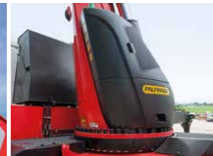
Functional design Practical and attractive

A 3.5 ton rope winch is available on the main boom or knuckle boom, featuring a high lifting capacity.