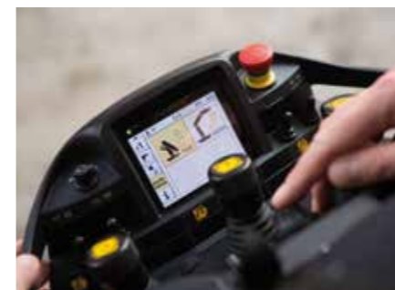
P-FOLD Perfect set-up by fingertip control

The Dual Power System allows multiple uses of the crane both for large outreaches as well as for heavy load operation.