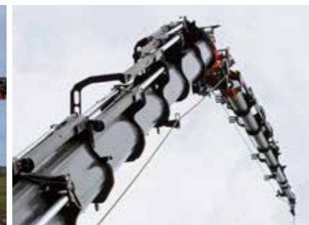
Extension boom system Excellent stability, even at a height

With the 15 degree reverse linkage system on the knuckle boom and the 25 degree reverse linkage system fly-jib, you can reach through low door openings and also work inside buildings. Heavy crane work – even in difficult conditions.