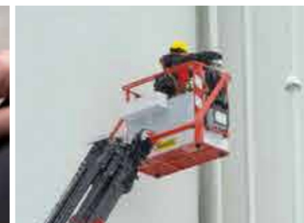
Workman basket Maximised functionality

The new assistance system makes folding and unfolding an easy job for the crane operator. This significantly increases operator comfort and prevents costly damage.