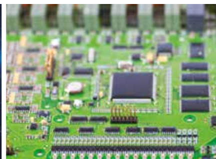
S-HPLS More lifting power when it counts

The modular system HPSC-Plus offers three modules expanding HPSC. Thanks to load detection, length measurement system or stabilizer force detection, lifting capacity can be maximized.