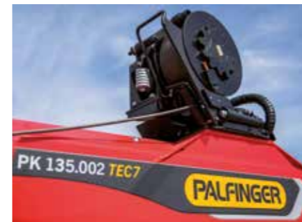
Rope winch Additional possible applications

The new PALcom P7 features a modern, ergonomic design. The centrally located knob „PALdrive“ and a large colour display enables easy and safe operation.