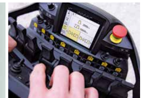
MEXT and WEIGH Systems for easy handling

With the aid of the workman basket, additional duties like installation and maintenance work can be performed with the crane.