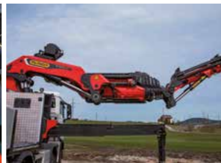
Power Link Plus High variety of uses

More efficient in operation due to faster loading cycles, since the crane can be slewed over a shorter distance. The crane works more efficiently and faster.