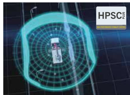
HPSC-Plus Maximum utilization of the working range

Thanks to the use of high-strength fine-grain structural steels in combination with a new extension boom profile, stiffness is increased and weight reduced.