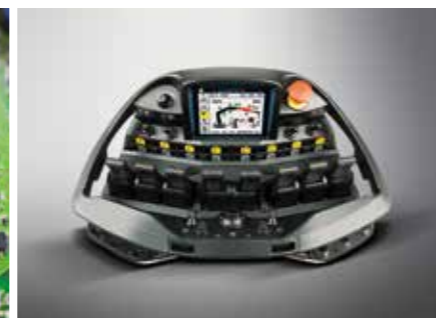
PALcom P7 Communication with the operator

S-HPLS is one of the most important functions of the PALTRONIC. It is a fully automatic system for increasing lifting power. The lifting power and crane speed can be continuously adapted to suit requirements.