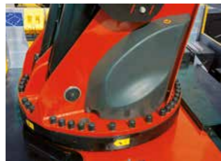
Continuous slewing system Unrestricted movement

More efficient in operation due to faster loading cycles, since the crane can be slewed over a shorter distance. The crane works more efficiently and faster.