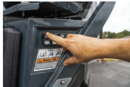
Relax the transport chains