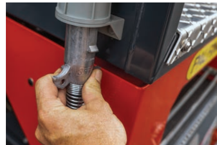
Retract and stow the suzie cable