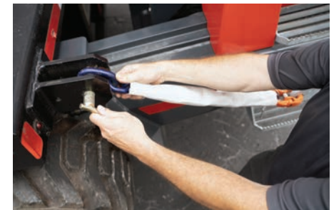
Unpin and stow the transport chains