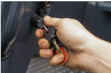
Start the engine with the ground level ignition key