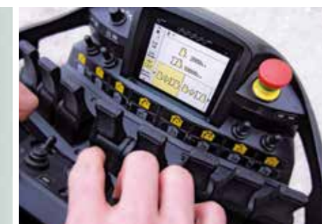
MEXT and WEIGH Systems for easy handling

With the aid of the workman basket, additional duties like installation and maintenance work can be performed with the crane.