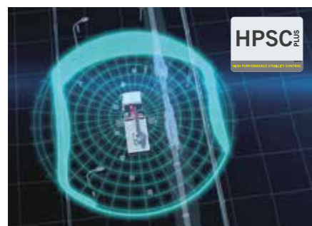
HPSC-Plus Maximum utilization of the working range

Thanks to the use of high-strength fine-grain structural steels in combination with a new extension boom profile, stiffness is increased and weight reduced.