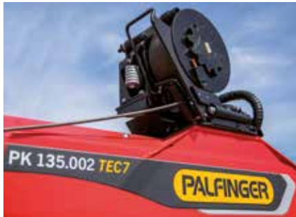
Rope winch Additional possible applications A 3.5 ton rope winch is available on the main boom or knuckle boom, featuring a high lifting capacity.