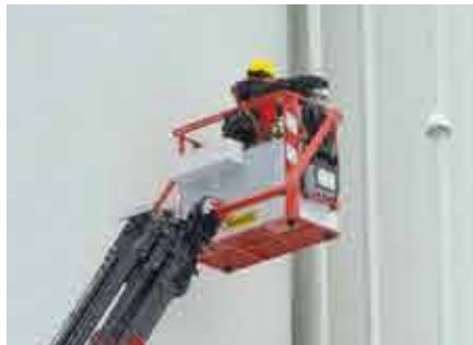
Workman basket Maximised functionality With the aid of the workman basket, additional duties like installation and maintenance work can be performed with the crane.