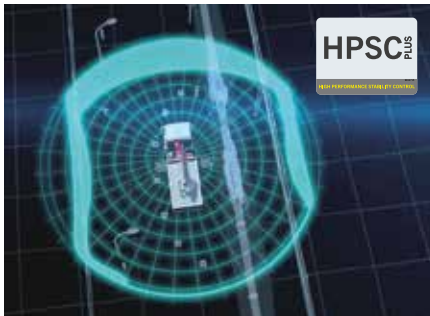
HPSC-Plus Maximum utilization of the working range The modular system HPSC-Plus offers three modules expanding HPSC. Thanks to load detection, length measurement system or stabilizer force detection, lifting capacity can be maximized.