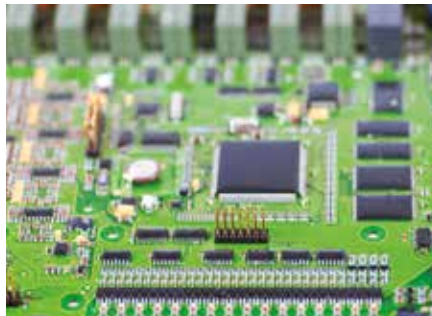
S-HPLS More lifting power when it counts S-HPLS is one of the most important functions of the PALTRONIC. It is a fully automatic system for increasing lifting power. The lifting power and crane speed can be continuously adapted to suit requirements.