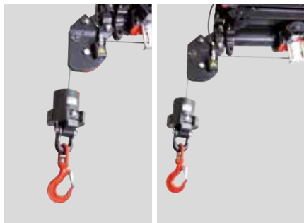
SRC and RTC More comfort in rope winch operation SRC (Synchronised Rope Control) maintains a constant distance between the pulley head and the hook block, while RTC (Rope Tension Control) is automatically controlling the rope tension. Two systems, which are particularly valuable in terms of operator friendliness and efficiency of operations.