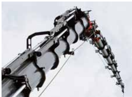
Extension boom system Excellent stability, even at a height Thanks to the use of high-strength fine-grain structural steels in combination with a new extension boom profile, stiffness is increased and weight reduced.