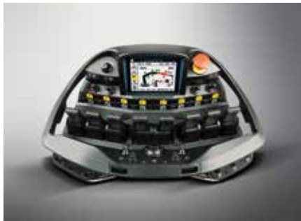
PALcom P7 Communication with the operator The new PALcom P7 features a modern, ergonomic design. The centrally located knob „PALdrive“ and a large colour display enables easy and safe operation.