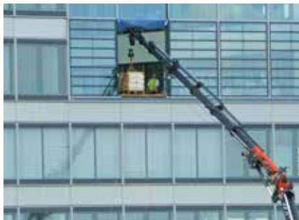
DPS-Plus / DPS-C More efficient fly jib operation The Dual Power System allows multiple uses of the crane both for large outreaches as well as for heavy load operation.