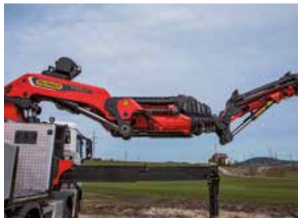
Power Link Plus High variety of uses With the 15 degree reverse linkage system on the knuckle boom and the 25 degree reverse linkage system fly-jib, you can reach through low door openings and also work inside buildings. Heavy crane work – even in difficult conditions.