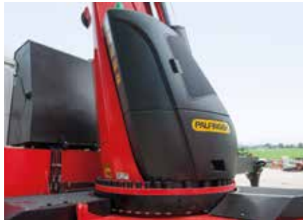
Functional design Practical and attractive Robust plastic covers protect crane parts against dirt and damage. Improved looks and increased operational comfort – throughout the entire lifetime.