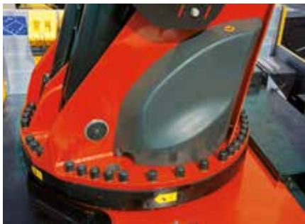
Continuous slewing system Unrestricted movement More efficient in operation due to faster loading cycles, since the crane can be slewed over a shorter distance. The crane works more efficiently and faster.