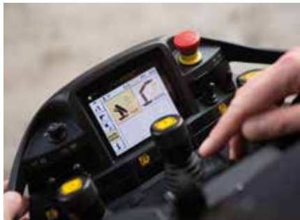
P-FOLD Perfect set-up by fingertip control The new assistance system makes folding and unfolding an easy job for the crane operator. This significantly increases operator comfort and prevents costly damage.