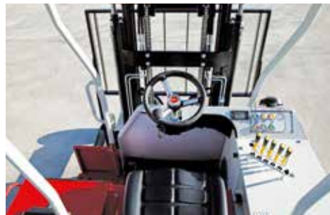
COMFORT AND OVERVIEW