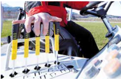
WORK PRECISELY WITHOUT FATIGUE