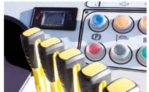
CONTROLS AND INFORMATION