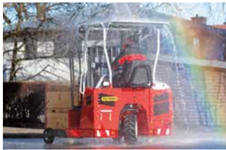
THE BEST WEATHER PROTECTION