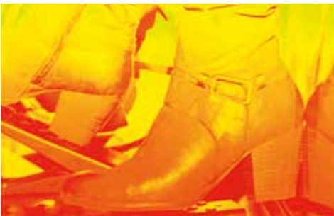
MOTIVATION AND OPERATIONAL READINESS