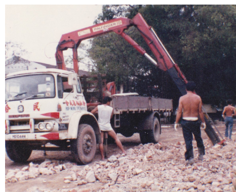
First Palfinger Crane owned by Hup Meng in 1985