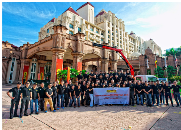
SMM 2016 Group shot with the new launching crane

The SMM ended with an opportunity for all the participants to exchange their visions about how Service will be in the future.