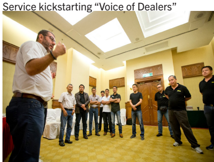
"Voice of Dealers" workshop