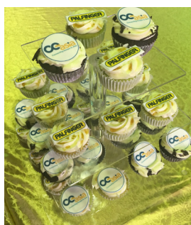
Custom-made CE Asia and Palfinger cupcakes