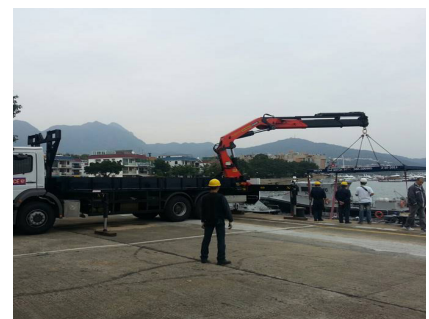
Hong Kong Police using Palfinger Knuckle Boom Crane