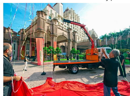
Launching ceremony for PK 7.501 SLD 5