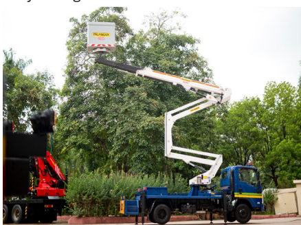
Aerial Platform - P240 A