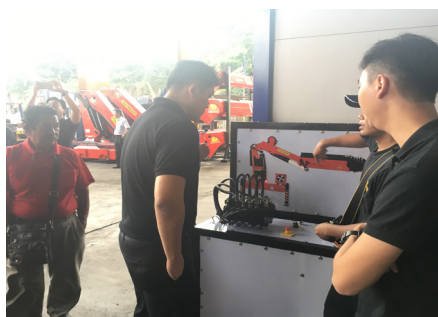
Crane stimulation during the event