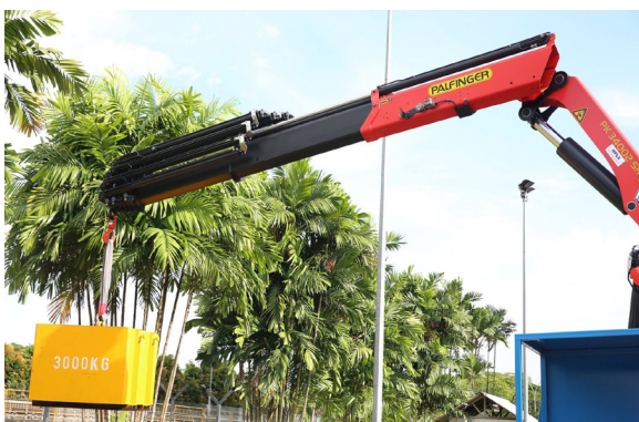
PK 34002 SH lifting 3 tonnes load during workshop