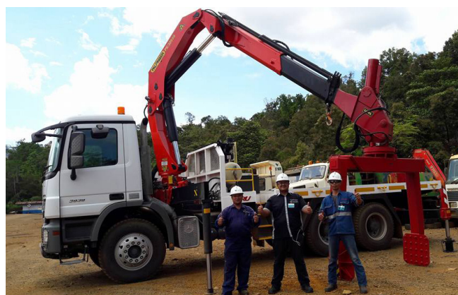
Left to right: PRU Staffs together with the operator