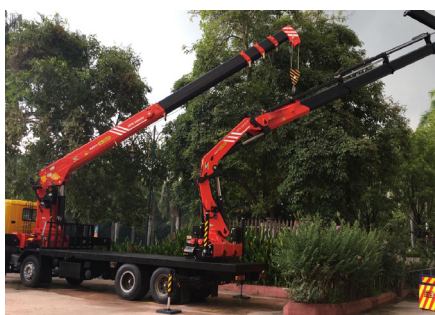
Sany Palfinger - SPK 42502 with SPS 50000