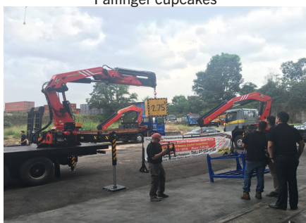
On site of the Radio Remote Control Competition