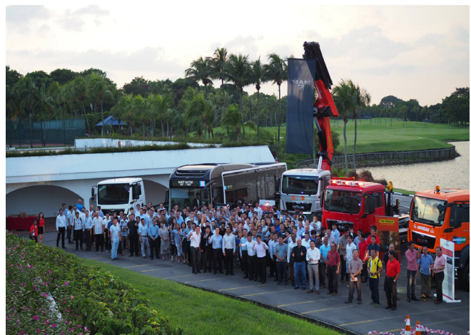
Guest at the Singapore Business Night with ST Kinetics, Man Truck and Bus, Wong Fong Industries and Palfinger Asia

Thanks to Wong Fong Industries, we are invited to participate in the annual Singapore Business Night 2016. Our Palfinger Knuckle Boom Crane and Hookloader mounted on the MAN Truck is on display for the whole event.