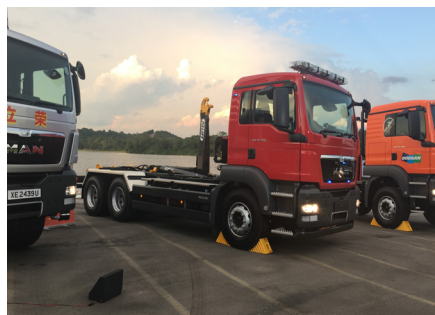
Palfinger Hookloader with MAN Truck