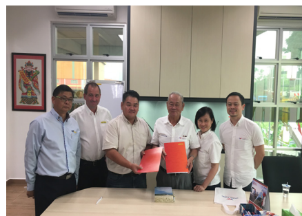
Partner signing Ceremony between Syarikat Seng Brothers Construction and CE Asia