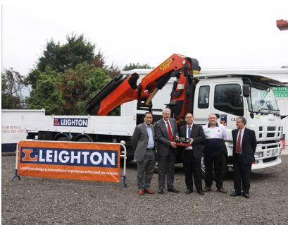
Leighton purchase Palfinger Knuckle Boom Crane in 2011

Foreseeing the upcoming generation transition, CAE's future vision on PALFINGER's products is not just about the products themselves. It is all about the solutions that the products bring upon to the end users.