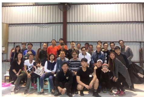
CAE group shot in the office in Hong Kong