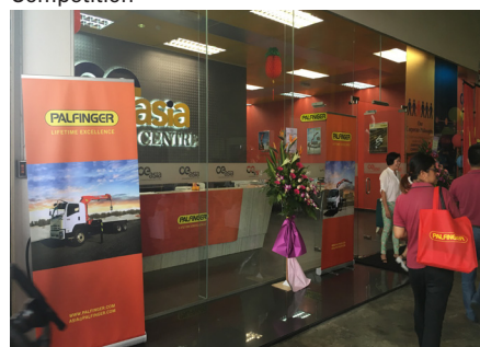
CE Asia workshop according to Palfinger Service Workshop standards