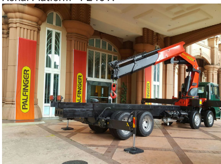
Palfinger Knuckle Boom Crane - PK 88002