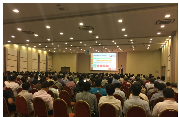
Sharing of information from WSH Council and MOM to the operators