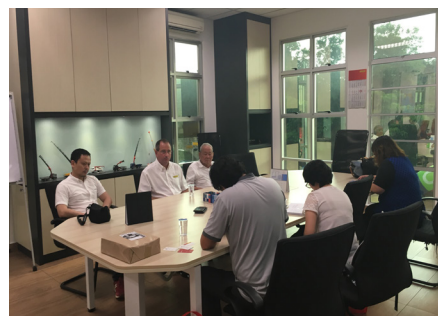
Interview conducted by Asian Trucker & Truck and Bus