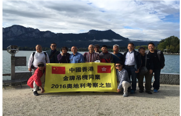
CAE together with their key customers

experience operating the crane. It is a very fulfilling tour as they end it off with a local tour around Salzburg and Vienna.