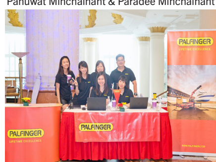
Palfinger Asia Check in Area with PAP team