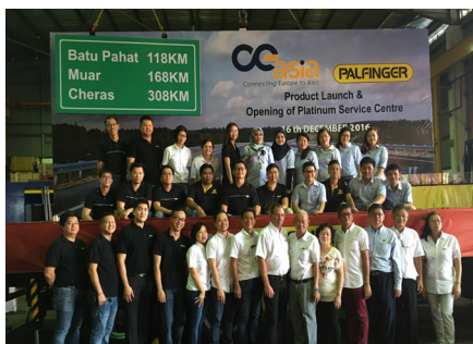
Representatives from Wong Fong Industries, CE Asia and Palfinger Asia