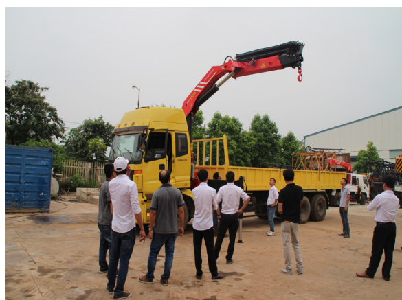
On site with SPK 23500 with PAP and Thang Long service team

Furthermore, we conducted a simple basic troubleshooting on the new cranes so to equip Thang Long to provide after-sales servicing for the end users in future.