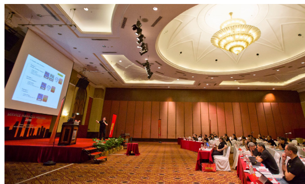
Exchanging valuable service information for all different key products