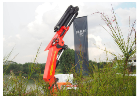
PK 110002 SH with MAN Truck & Bus Flag