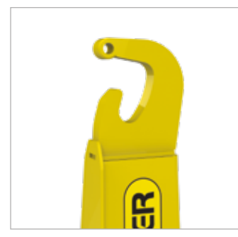
New hook shape

Easier catch and release of the container bar. Smooth sliding of the container bar inside the hook, reduces vibrations and thus also noise. The deep hook shape allows the safe horizontal movement of the container. Only available on HT 07 S.