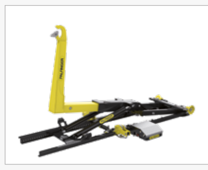
POP – Palfinger Origin Protection

Increased lifetime: before assembling the main components are sand-blasted, degreased, primer painted and electro statically final coated (according to customer specification). All other parts are anticorrosion treated. According to ISO 12944 Class3.