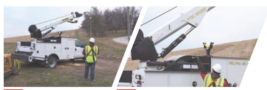
DEPLOY OUTRIGGERS & CRANE