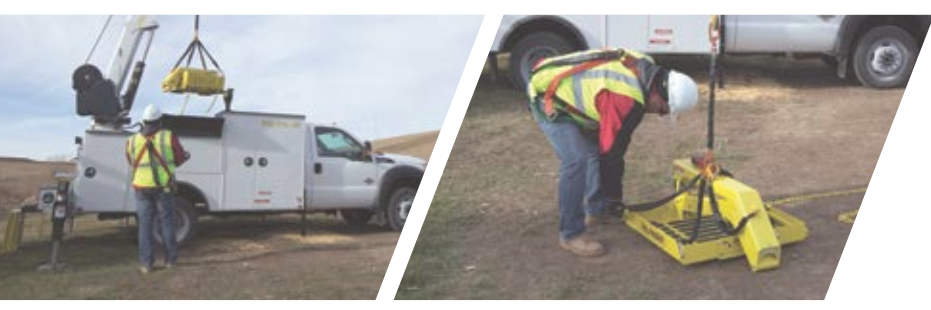
ATTACH PERSONNEL BASKET 4 REMOVE THE LOAD HARNESS FROM THE PLATFORM