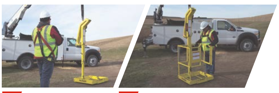
USE CRANE TO EXTEND THE TELESCOPIC SPINE