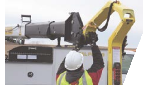
9 ATTACH PERSONNEL BASKET USING THE QUICK-CONNECT

FROM COMPLETELY STOWED TO WORK READY IN MINUTES.