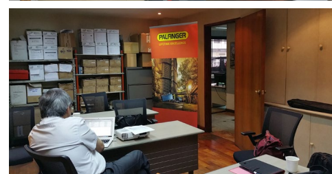
Right: Pinnacle office with Hook-loader roll up banner