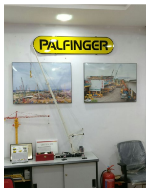
Left to right: Asia Group office and meeting room in Malaysia

All dealers will have mandatory branding in their premises as part of the PADI program we had introduced at the beginning of the year.