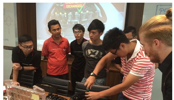
Service engineers hands-on session with Radio Remote control

Thanks to Wong Fong Industries, we have a theory class at the office and an on-site training for 2 days doing HPSC Calibration.